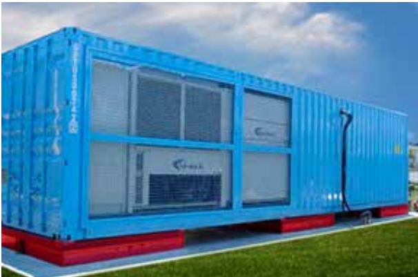
Modular Data Center in Costa Rica. It performed exceptionally well in a 2012 magnitude 7.6 earthquake.

Protection for Modular Data Centers from Seismic Events and Downtime.